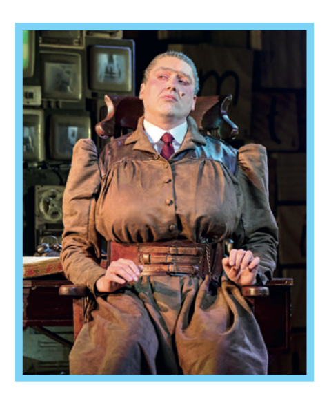
Miss Trunchbull Miss Trunchbull is the Headmistress of Crunchem Hall, Matilda's school. She is quite frightening and scares all the children (and teachers). The role of Miss Trunchbull is played by a man.