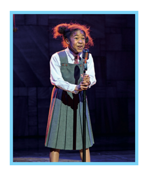
Lavender Lavender is Matilda's best friend at Crunchem Hall.