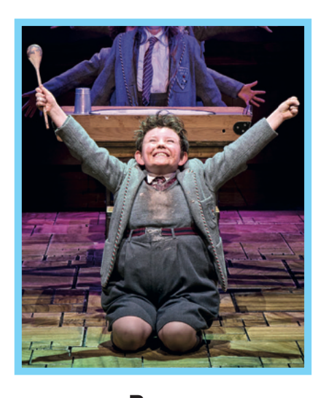
Bruce Bruce is one of Matilda's class-mates at Crunchem Hall.