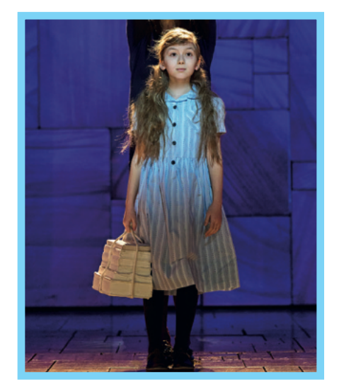
Matilda Wormwood Matilda is our heroine and the daughter of Mr and Mrs Wormwood. Matilda is very clever and loves to read books.

Below are pictures of the different actors and the name of the characters they play. Some actors play more than one character and, so that they look different, they change the way that they move and talk and their costume (a costume is the name for clothes that actors wear on stage).