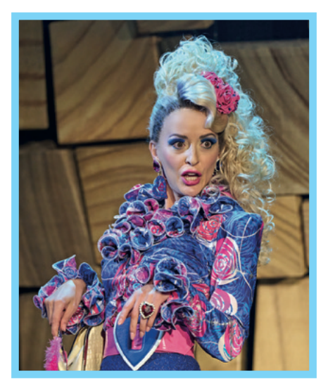
Mrs Wormwood Mrs Wormwood is Matilda's mum. She loves bright colours, salsa dancing and being LOUD!