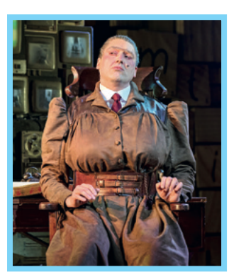
Miss Trunchbull Headmistress