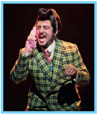
Mr Wormwood Dad