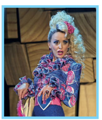
Mrs Wormwood Mum