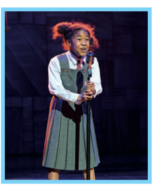
Lavender Best friend