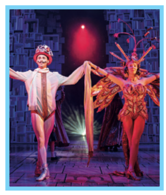
The Escapologist and the Acrobat