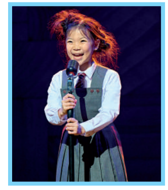
Lavender Best friend