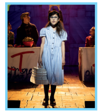
Matilda Main character

Some actors change character by wearing different clothes, changing their name and the way they move and talk.