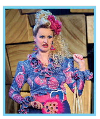
Mrs Wormwood Mum