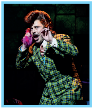
Mr Wormwood Dad