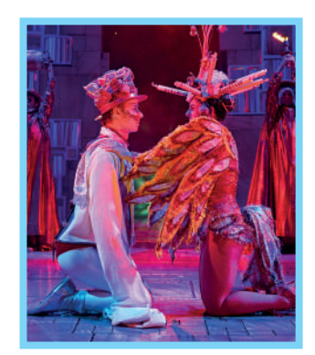
The Escapologist and the Acrobat