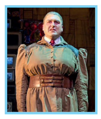
Miss Trunchbull Headmistress