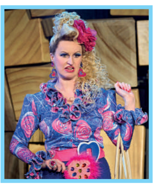
Mrs Wormwood Mum