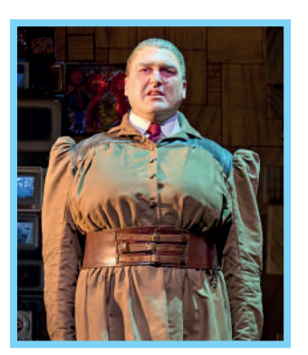
Miss Trunchbull Headmistress