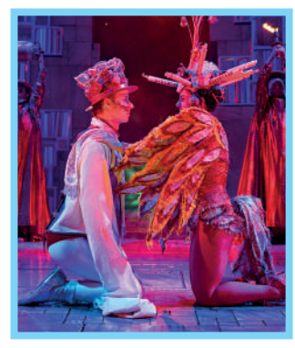
The Escapologist and the Acrobat