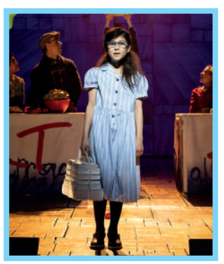
Matilda Main character

Some actors change character by wearing different clothes, changing their name and the way they move and talk.