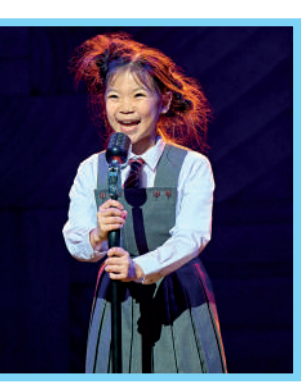
Lavender Best friend