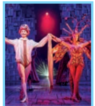
The Escapologist and the Acrobat