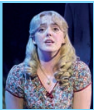
Miss Honey Teacher