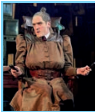
Miss Trunchbull Headmistress