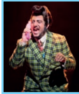
Mr Wormwood Dad