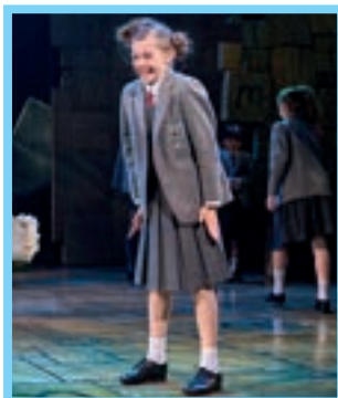
Lavender Best friend