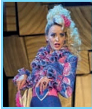
Mrs Wormwood Mum